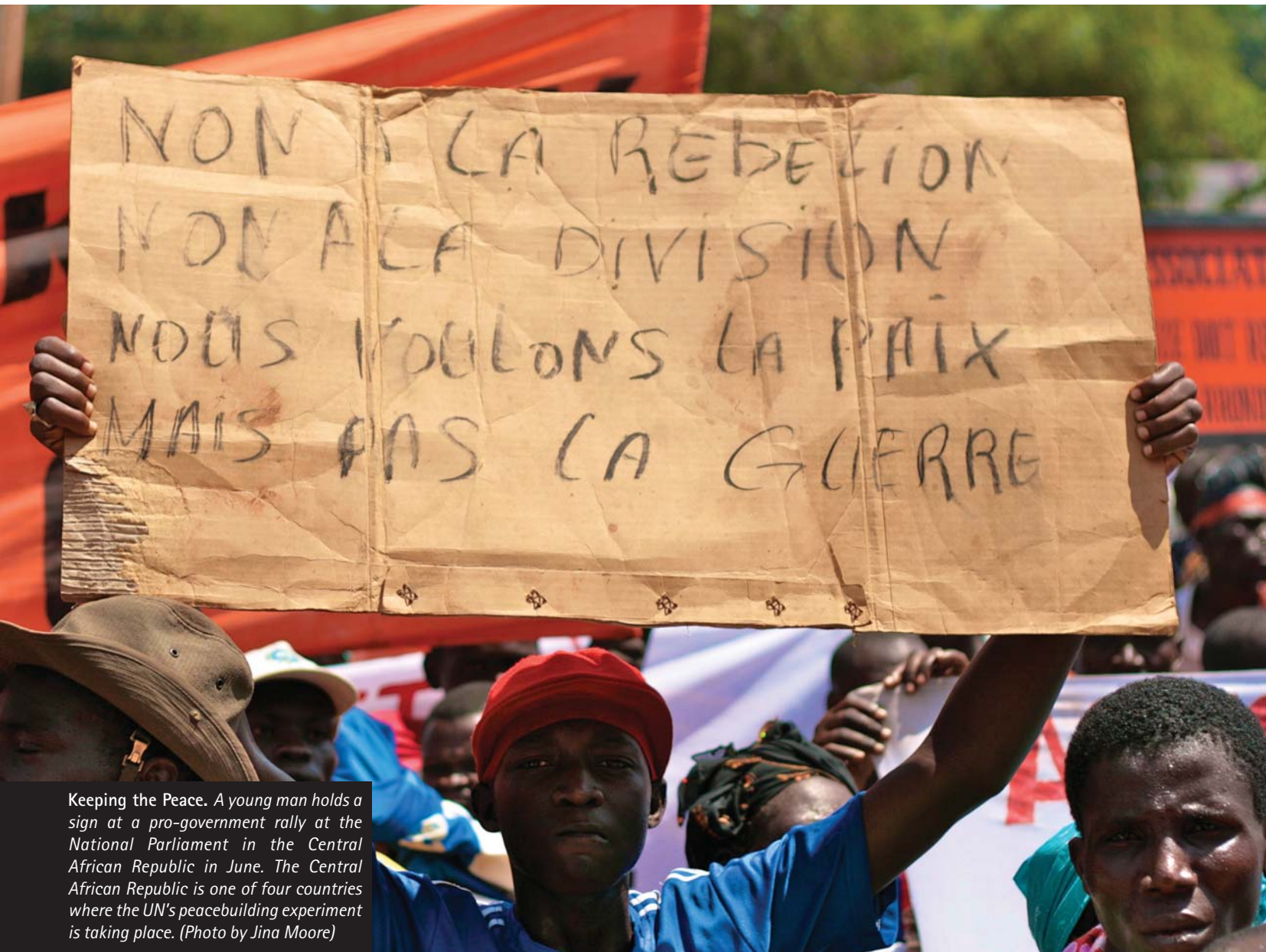
Keeping the Peace. A young man holds a sign at a pro-government rally at the National Parliament in the Central African Republic in June. The Central African Republic is one of four countries where the UN's peacebuilding experiment is taking place.