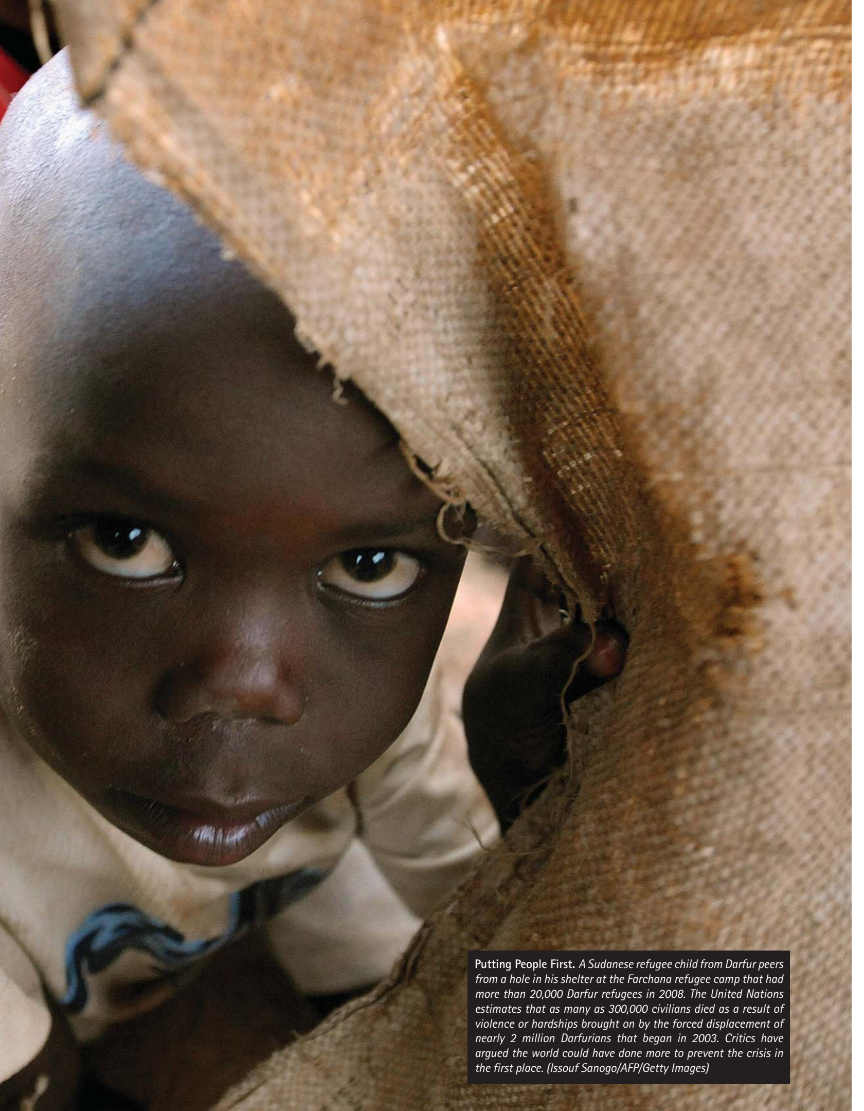
Putting People First. A Sudanese refugee child from Darfur peers from a hole in his shelter at the Farchana refugee camp that had more than 20,000 Darfur refugees in 2008. The United Nations estimates that as many as 300,000 civilians died as a result of violence or hardships brought on by the forced displacement of nearly 2 million Darfurians that began in 2003. Critics have argued the world could have done more to prevent the crisis in the first place.