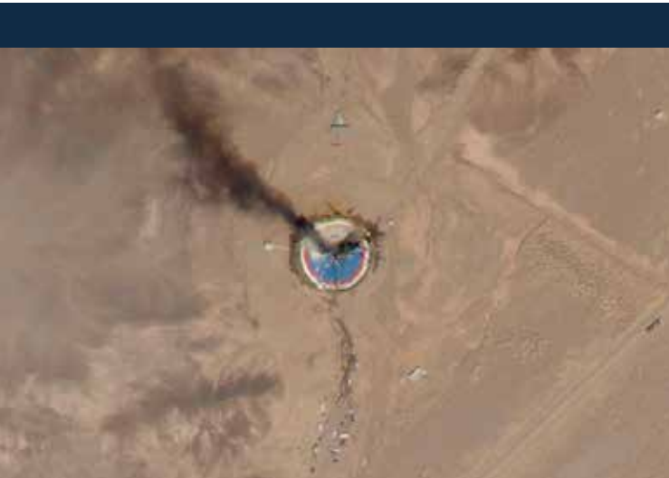
Commercial satellite image shows smoke rising from an explosion at the Imam Khomeini Space Center in Iran. August 29, 2019.

One essential aim in journalism ethics is accountability. Given the power of the press, it is important for journalists to take responsibility for their individual work. This principle is part of the foundation of ethical journalism.