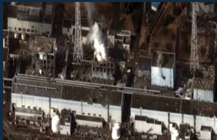
Commercial satellite image showing damage to the Fukushima Daiichi Power Plant. Japan, March 16, 2011.

This analyst had few resources to guide her ethical decision making and only four hours to decide. She opted to not publish the information but instead disseminate it to contacts in several governments and nongovernmental organizations.