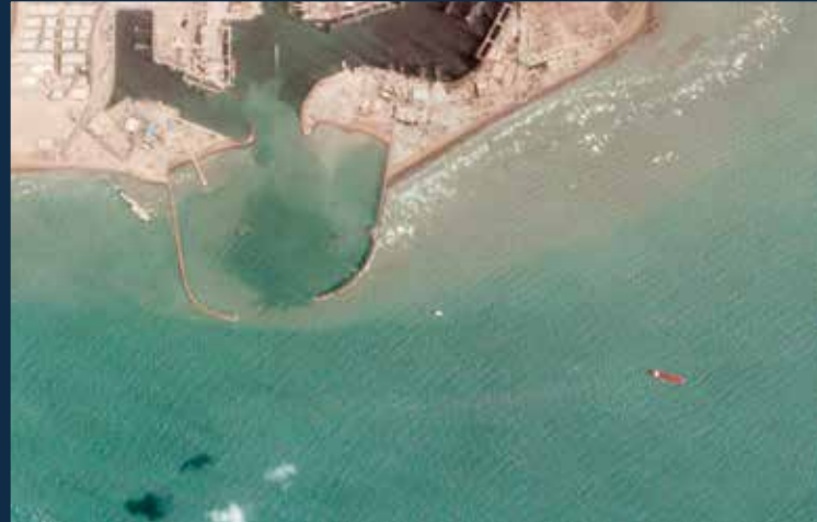
Commercial satellite image of the Stena Impero—a British oil tanker seized by Iran on July 19, 2019—in the Port of Bandar Abbas. Photo: July 20, 2019.

The participants recognized that a failure or lapse in judgement by one analyst in this community would affect the perception of the craft as a whole. However, the conversation on ethical practices with geospatial data and OSINT needs to expand beyond the analysts themselves. Participants in the workshop noted that other stakeholders—governments, commercial providers, funders, organizations, management teams, etc.—should contribute to the discussion on ethics in the community and reinforce sustaining behaviors. In fact, there may be some perverse incentives in the community to publish analyses quickly rather than after thorough review and quality control. Initial steps for gaining the involvement of such stakeholders could include having a focused discussion on ethics at major international conferences. Analysts in this community could also seek advice from and coordinate with organizations in adjacent fields with similar goals, like the Poynter Institute or the US Geospatial Intelligence Foundation.