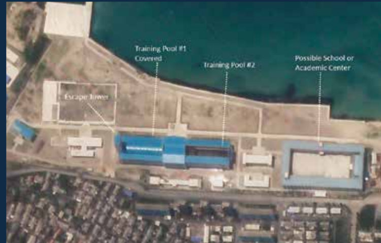
Commercial satellite image and open source analysis of the Sinpo Submarine Training Center in North Korea. Photo: July 19, 2019. Planet Labs Inc. CC-BY-NC-SA. via NKnews.

Participants in the workshop were overwhelmingly interested in coordinating with peers and colleagues to enhance the ethical practices of the community of analysts using geospatial data and OSINT. The demand is there. But the challenge is defining what specific resources are most needed and how to establish sustainable behaviors among community stakeholders.